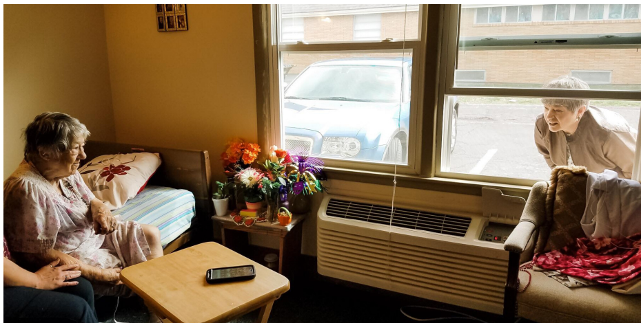
Window and patio visits have been allowed due to COVID-19 visitor restrictions.