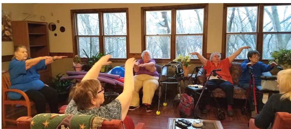
Residents exercise in our morning "Go Getters" class.